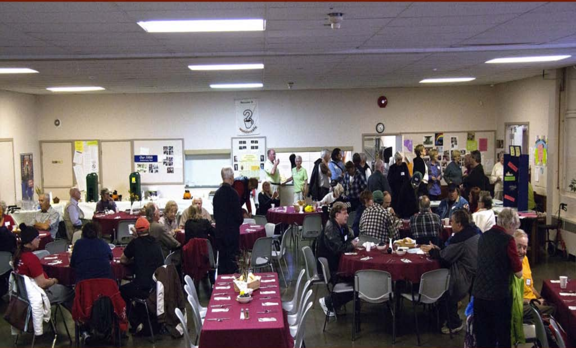
Community Dinner 12 October 2011